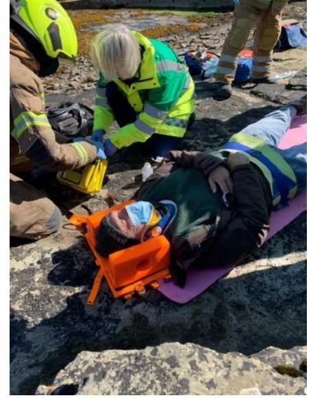
Simulation training in Papa Westray

Visiting Consultant Outpatient Clinics include: Paediatrics, Radiology, Ophthalmology and many others. There is also a tele-Neurology clinic that happens on regular basis.