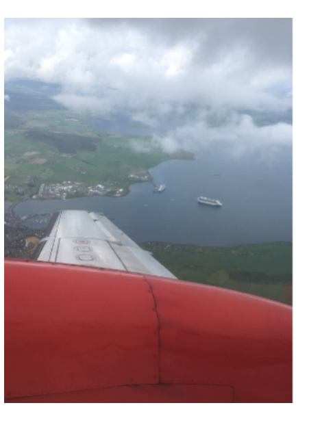
View of Kirkwall Harbour (onboard Loganair)

Find out more: <a href="https://www.orkney.com/things/history">https://www.orkney.com/things/history</a>