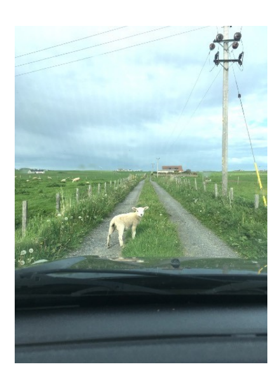
1st degree lamb encounters arecommon occurrence on countryroads...

Orkney has a thriving community where everyone can feel at home. Breathtaking views, rich historical and cultural heritage, low crime rate, excellent schools and leisure facilities make Orkney a very attractive place to live and work.